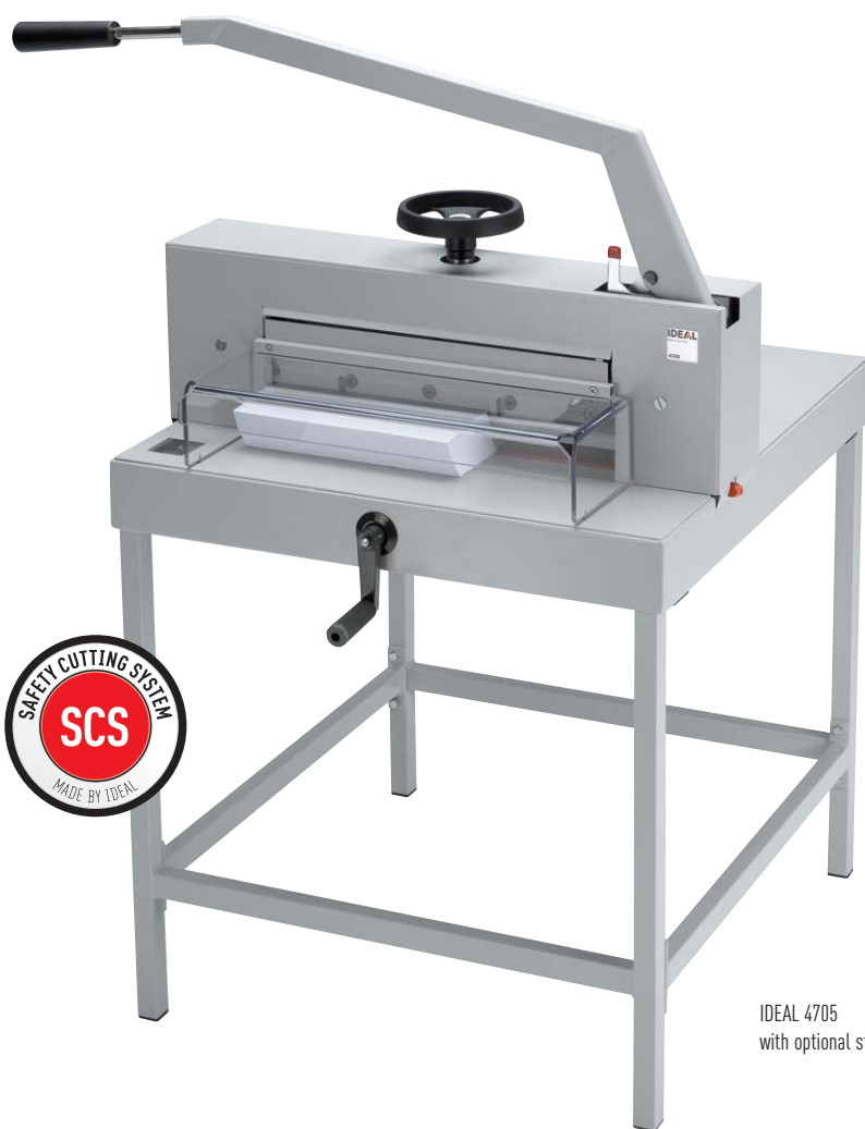
IDEAL 4705 with optional stand