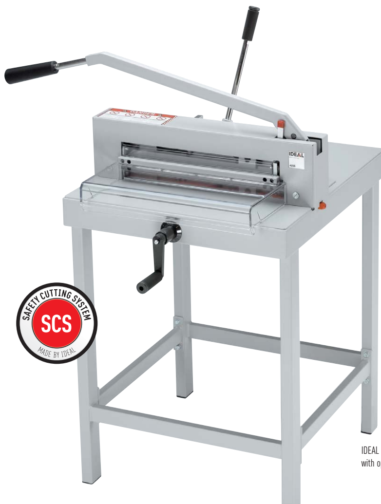
IDEAL 4205 with optional stand