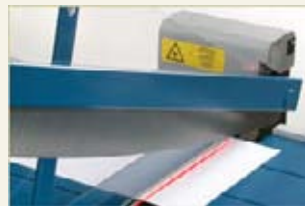
Laser module 00797