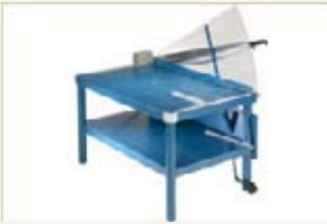
Fold-away off-cut table