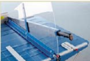
Plexiglas blade guard