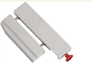
Narrow-strip cutting device 00793