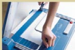
User-adjustable stay-down hand clamp for optimum paper clamping.