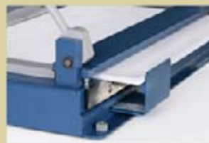
30 % more cutting capacity: Model 564 cuts 45 sheets of 70 gsm paper