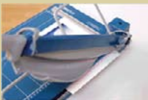
The laser beam indicates the exact cutting line.