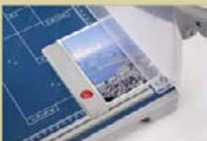
2 scale bars for exact alignment of the item to be cut.

Cutting length: 340 mm Cutting capacity: 2,5 mm Table size exterior dimensions: 450 x 285 mm Weight: 3,2 kg Bar code No: 4007885005607