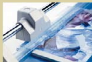
Automatic clamping on the cutting line