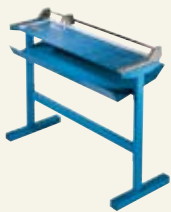
Optional features 00696 Stand